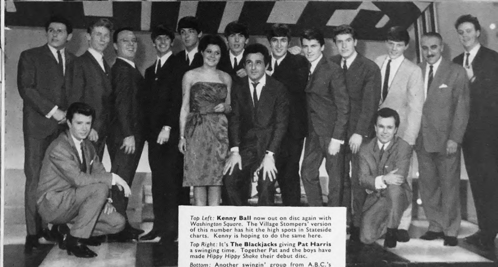
Top Left: Kenny Ball now out on disc with Washington Square . The Village Stompers' version of this number has hit the high spots in Stateside charts. Kenny is hoping to do the same here.